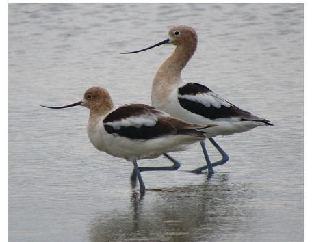
American Avocets

When accessible, this is one of the best spots in the country for viewing water birds year-round. The large sand flats are usually quite productive for Piping and Snowy Plover, Black Skimmer, and a variety of terns and gulls, at times hosting thousands of feeding shorebirds. Black Tern is common during fall migration. Check the shoreline for American Avocet, Sanderling, Willet, Ruddy Turnstone, Great Blue and Tricolored Heron, and Reddish Egret. The deep, fast-moving waters in the pass attract both species of pelican, cormorants, Red-breasted Merganser, and Common Loon in the winter. In summer, watch for Horned Lark and Wilson's Plover near the dunes, and for Magnificent Frigatebird soaring overhead and perched on pilings.