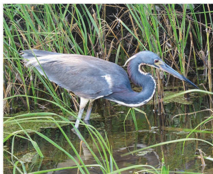
Tricolored Heron