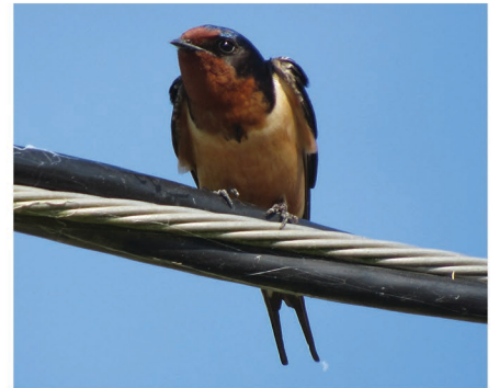
Barn Swallow

In winter, Osprey often perch low over the marsh. On the right, The Lorenz Family Jamaica Beach Bird and Fish Estuary provides nearly 10 acres of protected habitat that often attracts surface-feeding ducks in the winter. Turn around before the curve near the end of the road, and check the bay in winter for Common Goldeneye, Bufflehead, and Red-breasted Mergansers. During summer, swallows and Purple Martins are plentiful. Return to FM 3005 and turn right. Ready for lunch? If so, try Nate's West End Seafood and Steaks less than a mile ahead on the left before continuing. If not, continue to the next step.