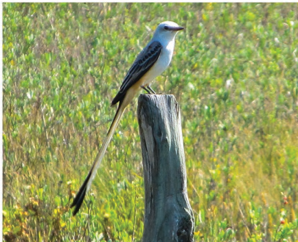
Scissor-tailed Flycatcher