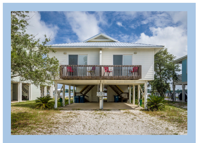
Lagoon Getaway Gulf Shores, AL