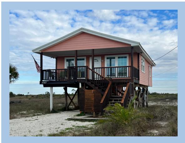
Cozy Cottage Fort Morgan, AL