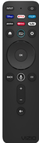
Master BR Vizio TV