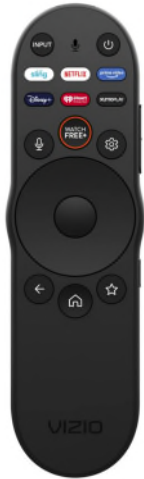
Living Room Vizio TV Remote