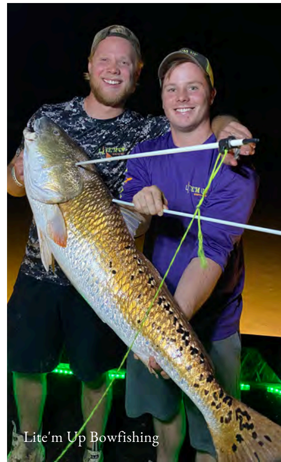
Lite'm Up Bowfishing