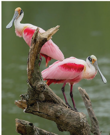
Roseate Spoonbills