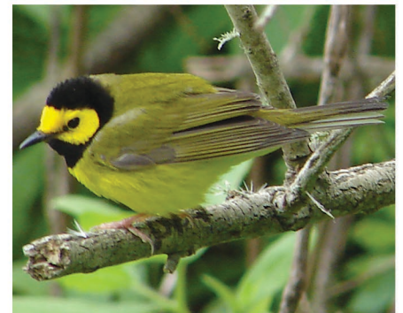
Hooded Warbler

Turn right on Eckert Drive into Lafitte's Cove, and park in the Nature Center parking lot. Check the ponds on the other side of the road for Roseate Spoonbill, Black-bellied Whistling Duck, Wilson's Snipe, and shorebirds. In winter, Bufflehead and Redhead may be seen. Cross back to boardwalk, quietly checking for Sora and the occasional Glossy Ibis in the pond on the right. In winter, Green-winged and Blue-winged Teal are common. Just past the boardwalk, the pond on the left is also good for waterfowl. Follow the trail to the right to check for Black-crowned Night-Heron and Green-winged Teal. During spring, the woods on the left are excellent for colorful migrants such as Baltimore Oriole, Indigo Bunting, Northern Parula, Hooded Warbler, tanagers, and up to 6 species of vireos. There are multiple water drips and a maze of trails, so plan to spend some time here.