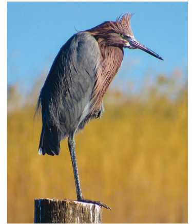
Reddish Egret

Turn on Sportsman Road, and scan the marshes on the left for Reddish Egret, Yellow-crowned Night-Heron, and Tricolored Heron. Look carefully in the ditches for Clapper Rail. Check the piers on the right for American Oystercatcher, Willet, and terns. In fall and winter, Belted Kingfisher and Osprey are common. Where the road dead-ends, scan the sand bars and jetty for plovers and sandpipers, Black Skimmer, and terns. Continue birding as you return to Stewart.