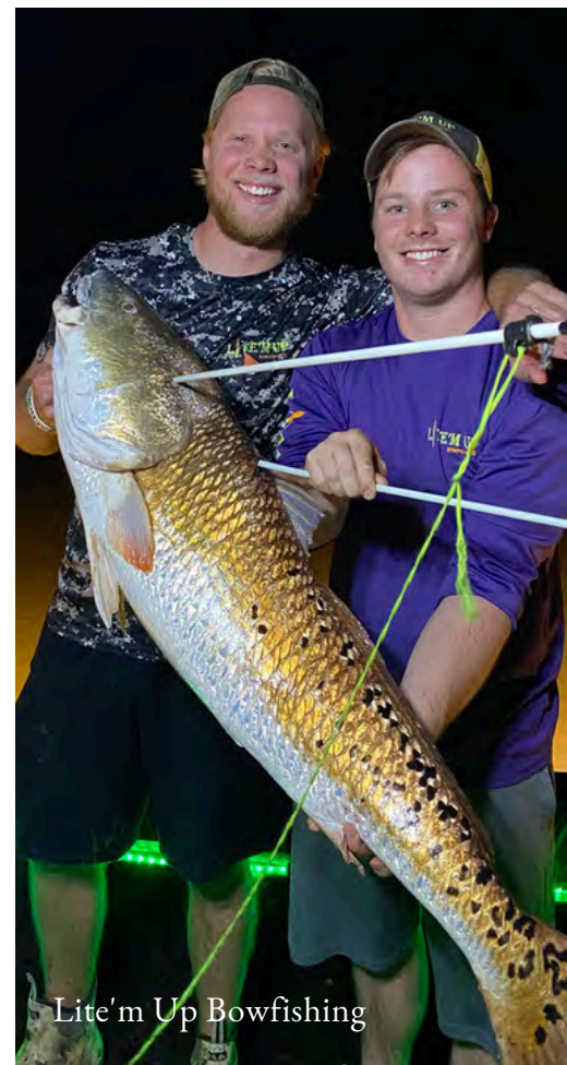
Lite'm Up Bowfishing