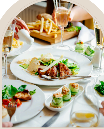
CRAFT AND VINE

201 Town Center Ln #1101 Keller, TX 76248